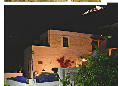
Moonlight over "Dimitri's"... Prawns in bacon and filo pastry with tomato marmalade...yum!