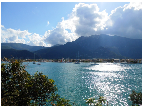
The lovely light at Nidri.